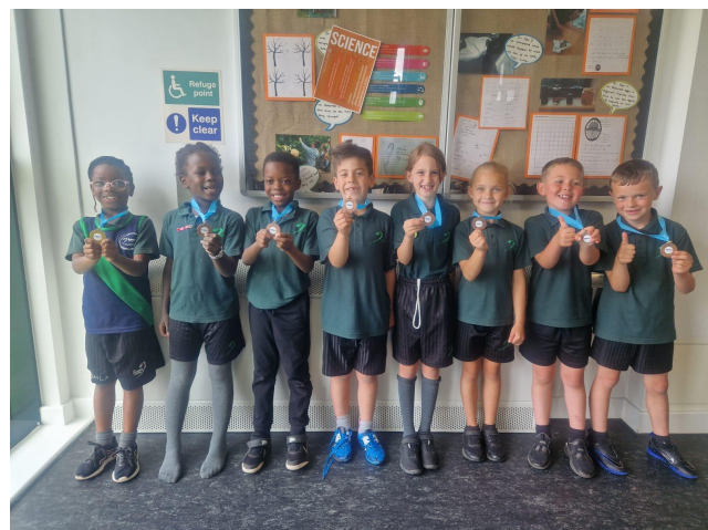
3rd Place - Year 1/2