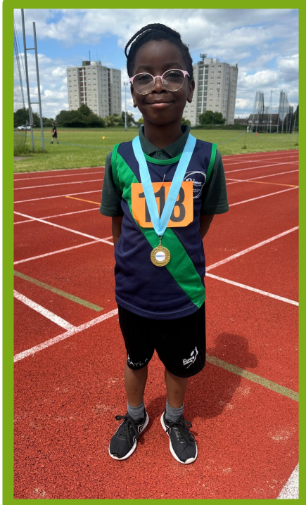
Highest Scoring Year 1/2