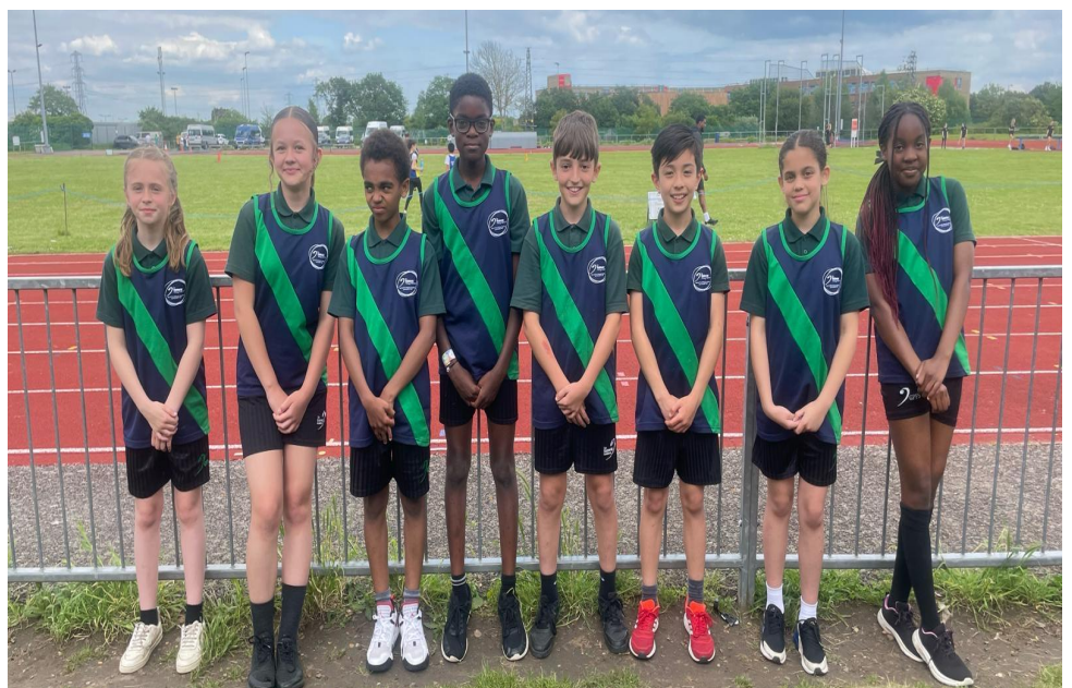
3rd Place - 5/6